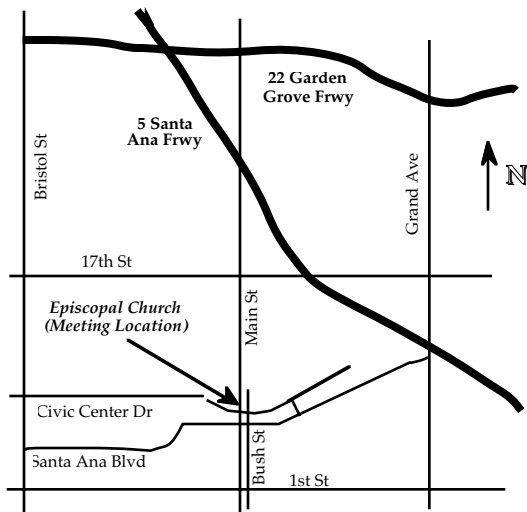
Group #141 Orange Meeting Location